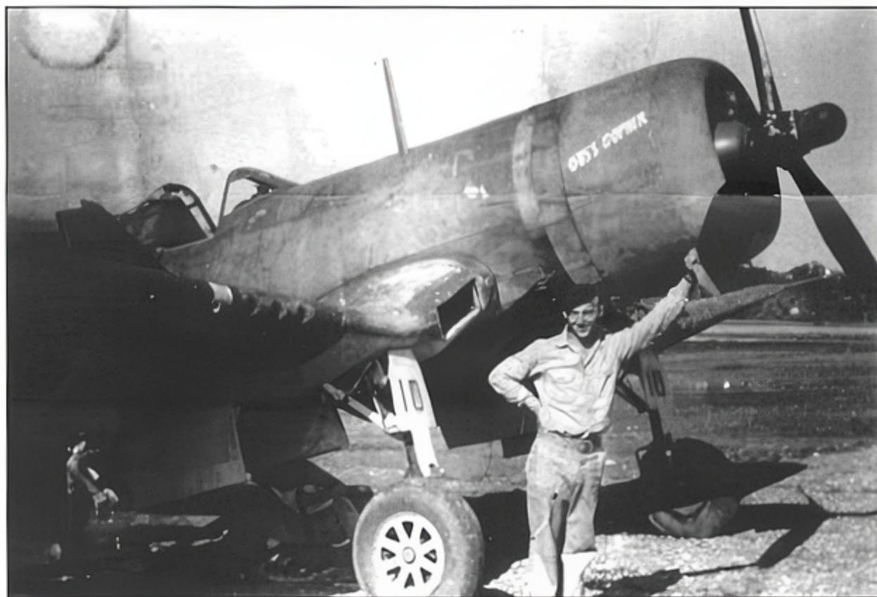
Above: Pilot Thomas' Flight Log indicating BuNo 02324 as White 10.