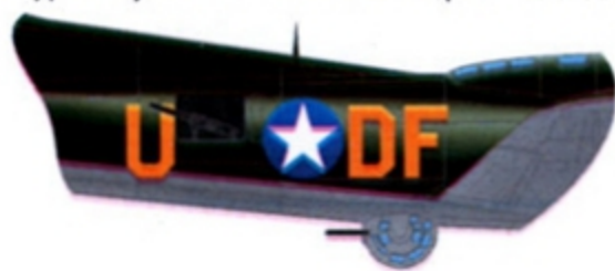
Typical layout for Starboard side Squadron/Aircraft ID

Alternate 'blue' Belle' included (handed for both sides)