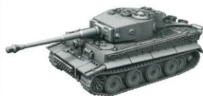
■ Mid Production (+ A mid production exhaust)