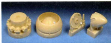
Master Patterns by Roy Sutherland

Check out more cool 1/48 Sea Fury sets and decals at www.barracudacals.com