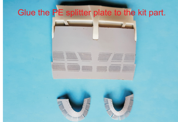
Form these "lace details" as shown.