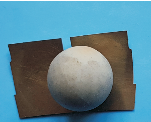
Form the PE splitter plate with a rubber ball or similar.