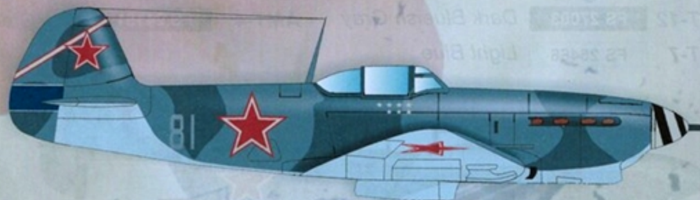
6 Yak-9T (pilot unknown) 117 GIAP/111 Fighter Regiment, Yugoslavia, 1945.