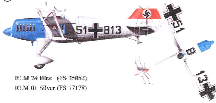
① He 51 A-1 3/JG 233, Wien-Aspern, 1938