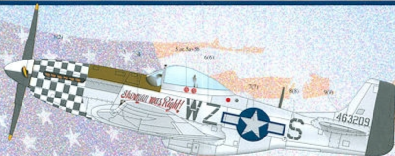
Aircraft 1 - P-51D 44-63209 'Sherman was Right', flown by Lt. Frank Oles, 84th FS, 78th FG. Natural metal finish, standard silver painted wings. Black rudder and antenna mast. Olive Drab antiglare panel. Spinner divided half-Black and half-White. Greyed out fuselage insignias. Shrouded exhaust.