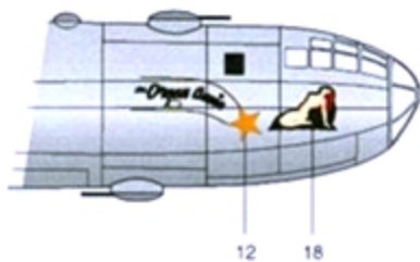
Starboard Triangle Construction

B-29 Serial Number 42-24893 "Little Organ Annie", 794th Bomb Squadron, 868th Bomb Group. Overall natural metal with Black de-icer boots. For space considerations, the fin triangle has been broken into separate pieces. See the construction diagrams below for proper placement. The propellers were black with yellow tips.