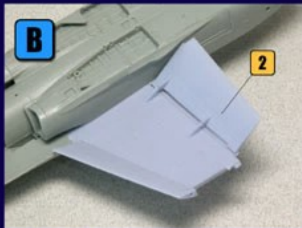
(B) Attach the flap

After attach main wing, you may attach the flap.