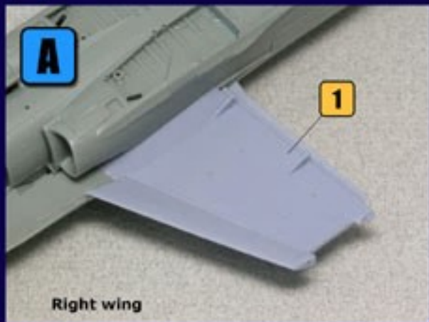
(A) Attach the main wing