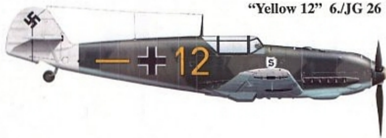
"Yellow 12" 6./JG 26