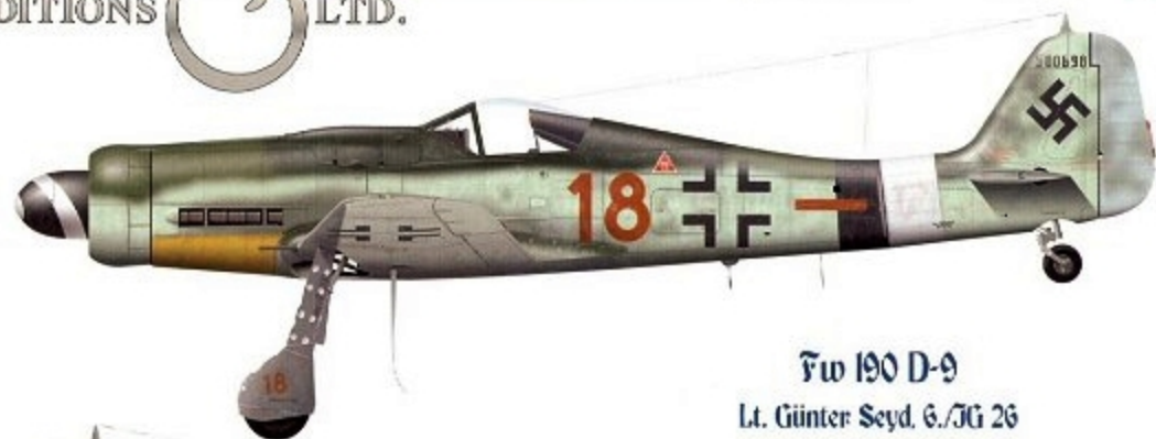
Fw 190 D-9 Lt. Günter Seyd, 6./JG 26