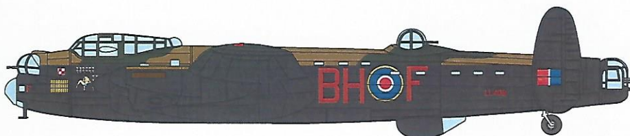
Avro Lancaster B.I LL804 BH-F (Lady in a champagne glass) 300 Sqn (Polish) Faldingworth 1944

Avro Lancaster of Wing Commander Teofil Pożyczka, LL804, BH-F, "Lady in the Champagne Glass" of No 300 Polish Bomber Squadron. 30 bombs for a first bombing sortie, 20 champagne glasses for a second sortie, 12 skulls for the third tour.