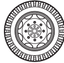
LATE WAR-TIME FRONT WHEEL