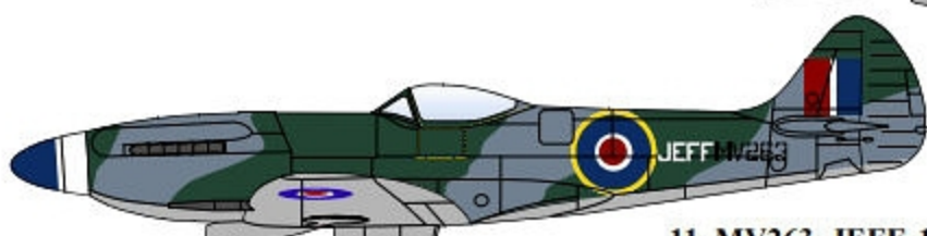
11. MV263, JEFF, 126 Wing,