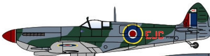
9. PT396, EJC, 416 Sqn,