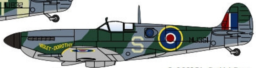
8. MJ351, S, 414 Sqn,