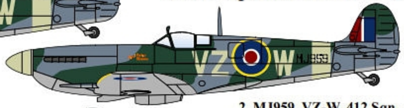
2. MJ959, VZ-W, 412 Sqn,