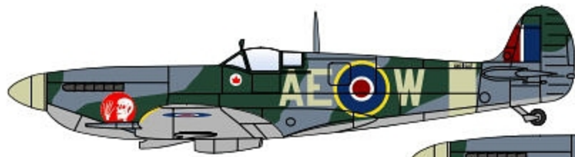
1. BS152, AE-W, 402 Sqn, 1943