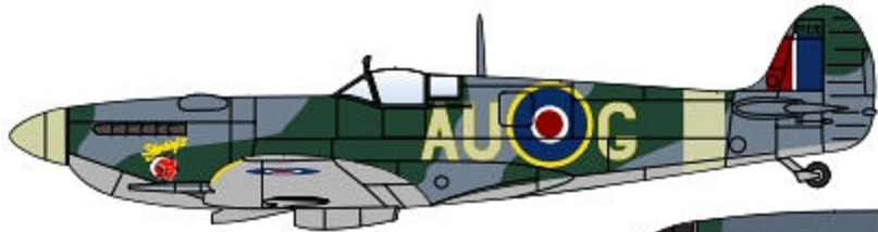
5. BR138, AU-G, 421 Sqn,