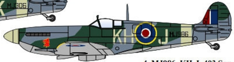
4. MJ986, KH-J, 403 Sqn,