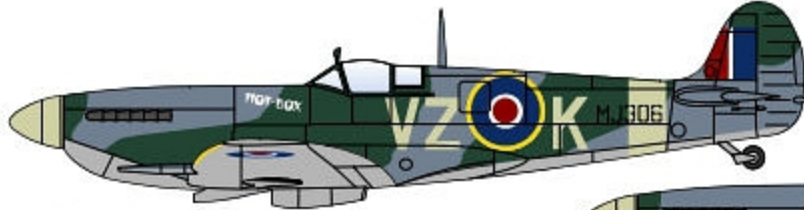
3. MJ306, VZ-K, 412 Sqn,