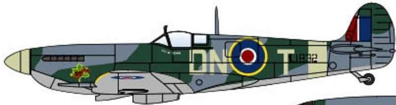
7. MJ832, DN-T, 416 Sqn,