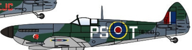
10. TB300, PS-T, 127 Wing, 1945