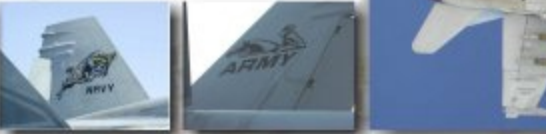
A/C 200 CAG